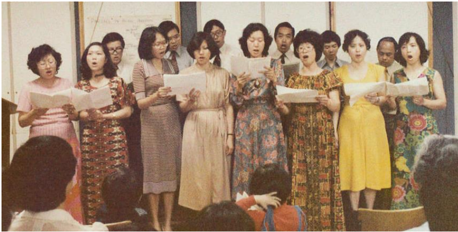
Eastern Suburbs Chinese Christian Fellowship started in August 1978. Christmas Choir presentation at St Andrews Uniting Church Box Hill