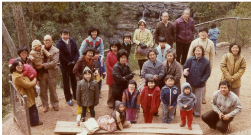
1983 ECCM Church Picnic 1983年教会的郊游活动

1986 Sunday School Kids and Youth Christmas Play.