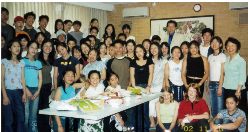
In 2002, Junior Youths from English and Cantonese congregations' activity at Holland Road Campus.